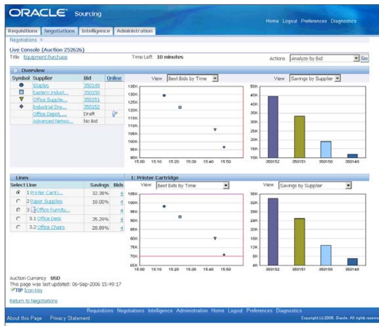
Figure 2: Monitor bidding activity as it happens with the Live Console

With Oracle Sourcing, events are prepared more quickly, concluded sooner, and agreements can be implemented as soon as they are signed. Because it structures requirements-gathering, sourcing events take less time to prepare. Oracle Sourcing consolidates requirements, amendments, and responses in one central location, so suppliers can bid more quickly. Online tools alert buyers to events that need additional supplier actions. Online competition saves time by motivating suppliers to improve terms without time-consuming back and forth negotiation. Agreements negotiated in Oracle Sourcing can also be immediately implemented in Oracle Purchasing. So you not only source more, you realize the resulting savings sooner.